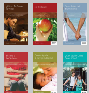
Six new minibook titles